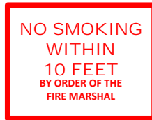
Figure 3 No smoking sign example